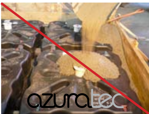
Bad image and logo

When used over an image, ensure that full visibility is possible.