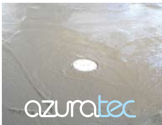
Good image and logo